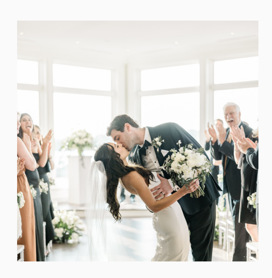
GLASS ENCLOSED CEREMONY SPACE