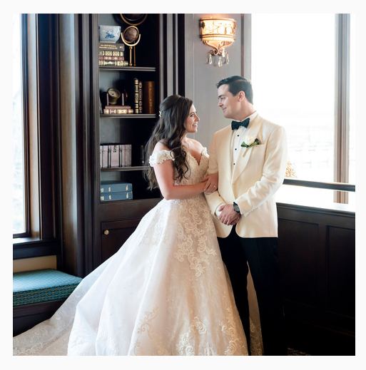
COCKTAIL ROOM & BAR